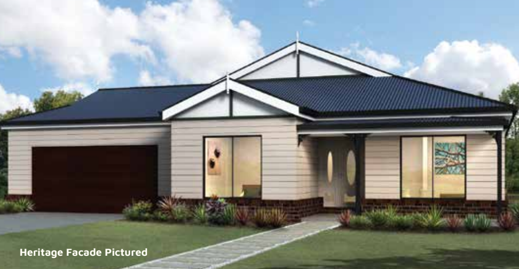
Heritage Facade Pictured