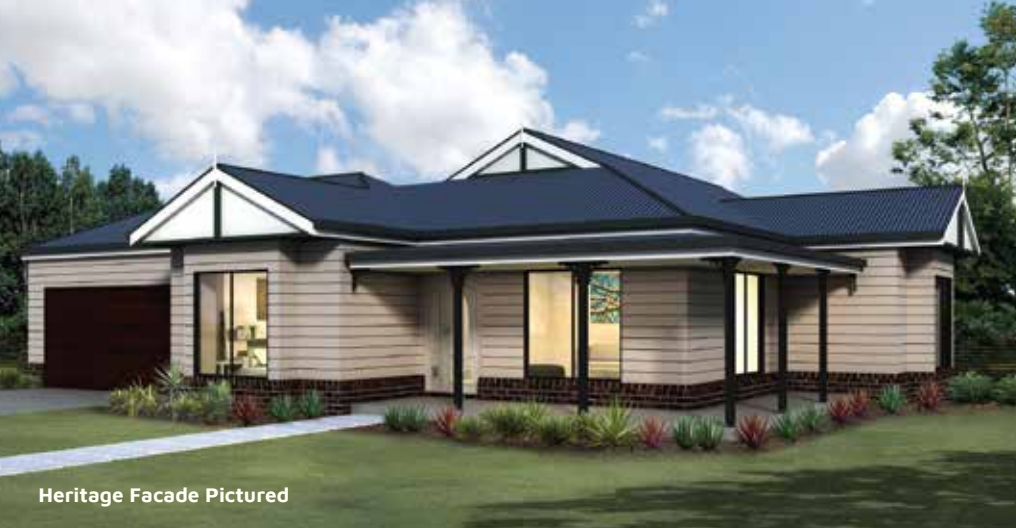
Heritage Facade Pictured