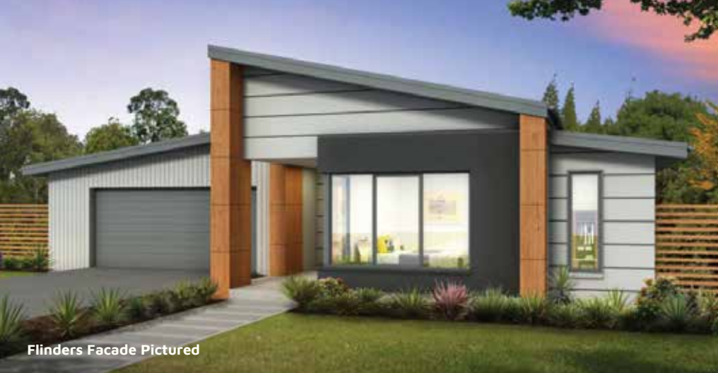
Flinders Facade Pictured