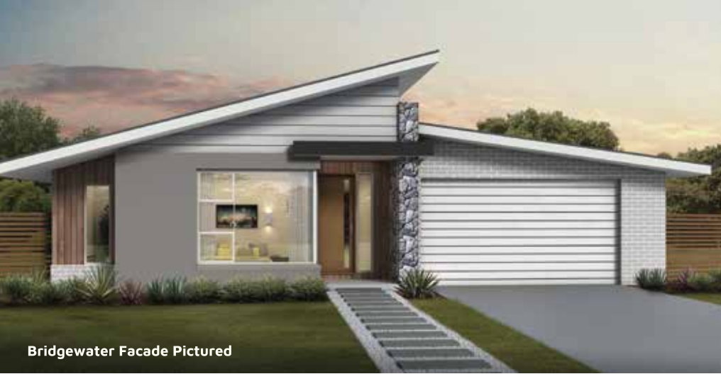
Bridgewater Facade Pictured