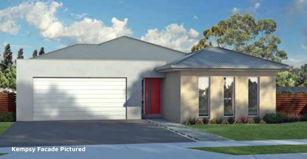
Kempsey Facade Pictured