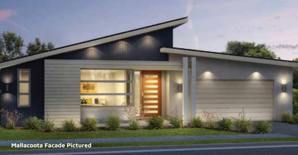
Mallacoota Facade Pictured