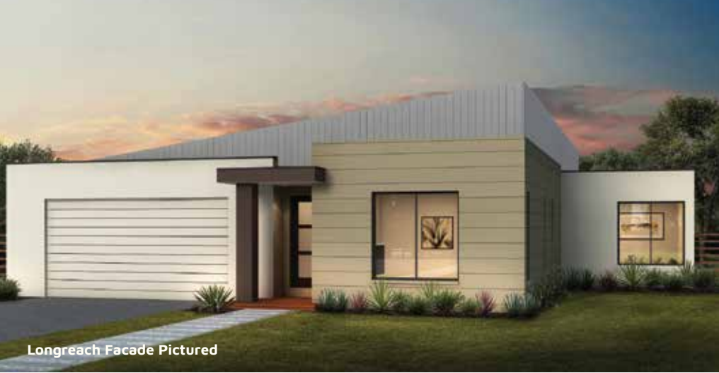
Longreach Facade Pictured